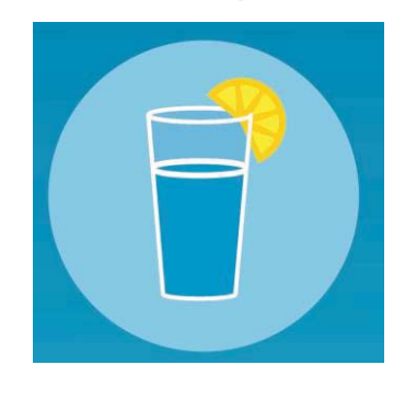
31 organizations: healthy meetings